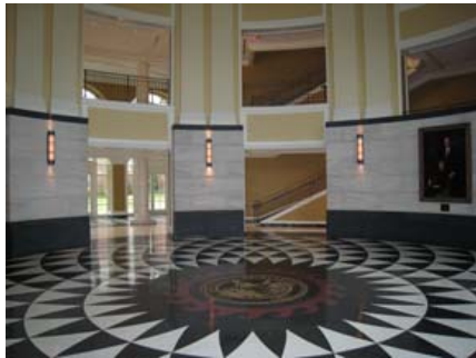
The University of Alabama Shelby Hall

The University of Alabama Department of Computer Science P. O. Box 870290 Tuscaloosa, AL 35487-0290